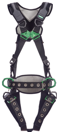
V-FLEX Construction Full-Body Harness