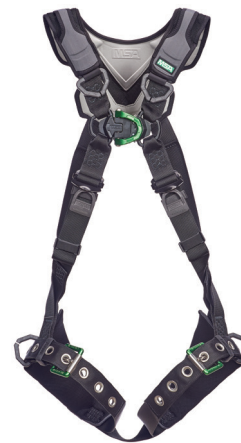
V-FLEX Standard Full-Body Harness w/Front D-Ring