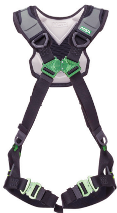
V-FLEX Standard Full-Body Harness