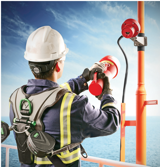
Fig. 3 – Flame detector being tested with test lam.