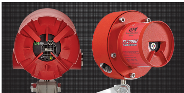
Fig. 1 – Examples of most common types of flame detectors

Customers have a variety of fixed optical flame detection technologies to choose from. The most common types are Multi-Spectrum Infrared (MSIR) and Ultraviolet/Infrared (UV/IR) flame detectors (Fig. 1). MSIR detectors use multiple infrared sensors monitoring different spectral frequencies for hydrocarbon fire detection. MSIR detectors offer an extended field of view optimal for large area monitoring and are a good option where maintenance is limited. However, they can be blinded by water, ice, & snow. Careful aiming in outdoor applications is recommended. UV/IR detectors use a single UV & IR sensor and perform 'AND gate' voting to detect most hydrocarbon fires and some non-hydrocarbon fires. They provide fast alarm response and an optional UV-only pre-alarm is useful in electrostatic paint and transformer applications. UV/IR detectors have a comparatively shorter detection range and can be blinded by silicones, dirt, soot, oil, solvents, water and ice.