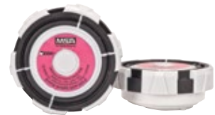
P/N 10146939 P100 Filters with Splash Guard

Please note: the Advantage 290 is approved for use with Advantage style particulate filter cartridges only. It is not approved for use with flexi, chemical or combination cartridges.